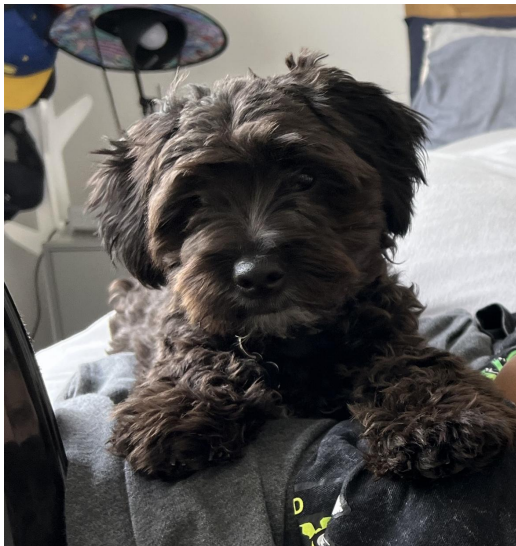
CHRIST THE KING and TEX